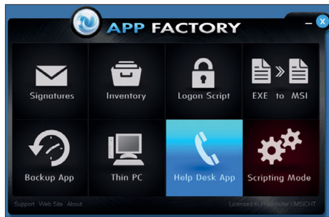
Illustration 1: The App Factory is a wizard-driven solution for creating scripts for some typical tasks.

our inventory data to the cloud, we decided initially for the "Set Up Local Inventory Server" option. In preparation we first installed the Express version of SQL Server 2012 on the local system. It then took just a few mouse clicks to complete the setup of the inventory server. The wizard consequently generated the database as well as the files required for the inventory server's web interface.