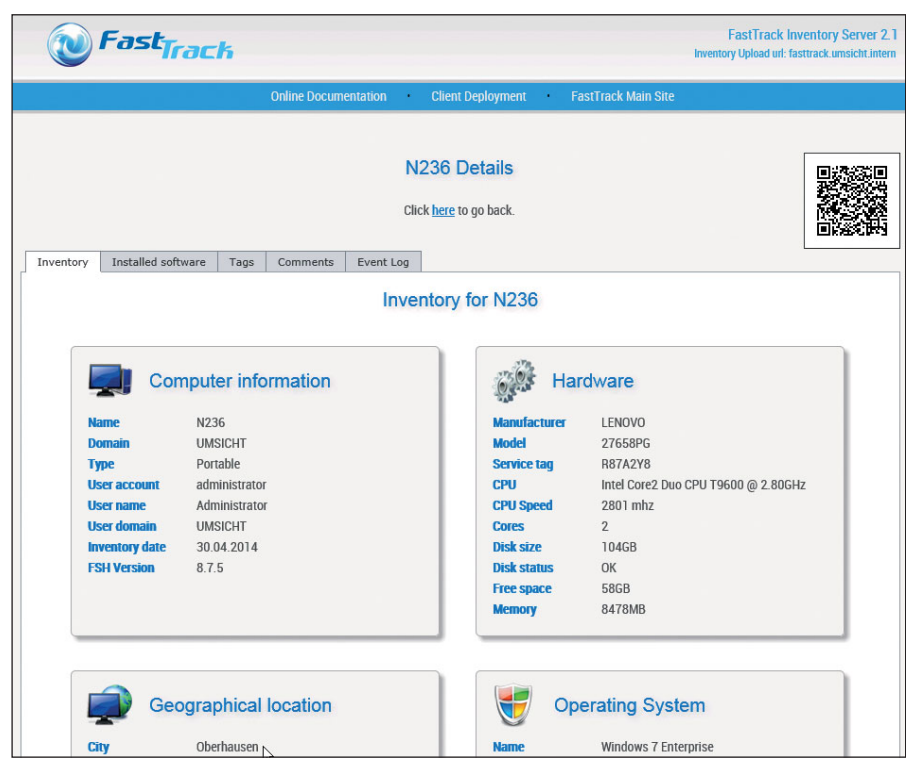
Illustration 2: The Inventory records the hardware and software configuration of the connected clients.